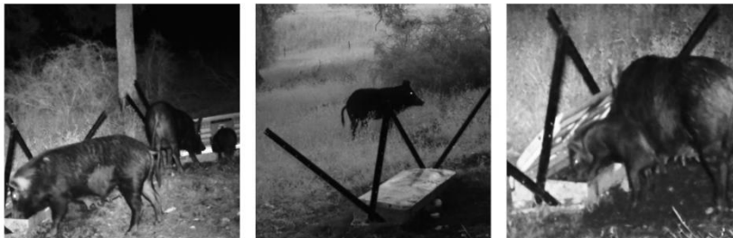
Feral pigs captured on surveillance cameras at one of LBG's HOGGONE installations.

Since late 2020, the LBG has enjoyed significant success utilising the HOGGONE® Feral Pig Control System. This system uses Sodium Nitrite as a poison to ethically control Feral Pigs which is presented in a way that heavily reduces potential off-target poisoning to other fauna. Additionally, use of this system does not require licences or registered training for landholders to use on their property.