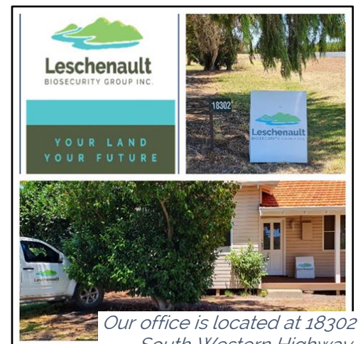
Our office is located at 18302 South Western Highway, Donnybrook

Having an office space also allows our team members to be more accessible to each other, providing for efficient and timely sharing of information and insight into status of programs, priorities and other activities to best support our landholders' needs.